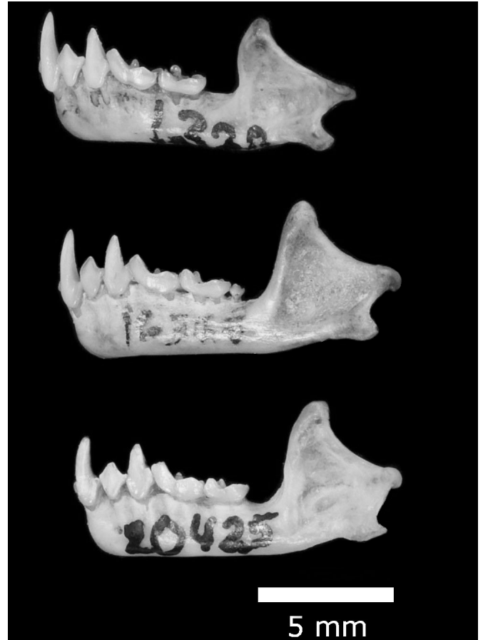
FIGURE 4. Note the difference of the concavity between the mandibular condyle and the angular process. Above: Artibeus bogotensis (MUSM 1320), in the center Artibeus glaucus (MUSM 16369), and below Artibeus anderseni (MUSM 20425).