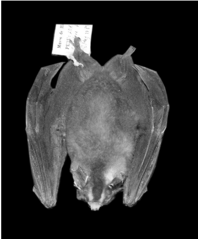
FIGURE 2. Skin of Artibeus bogotensis , illustrating the white lines above and below the eyes, and the white edge of the ears.