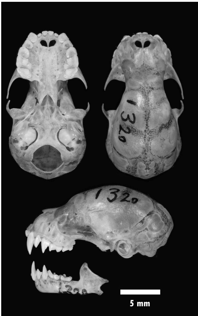
FIGURE 3. View of the skull of Artibeus bogotensis (MUSM 1320).