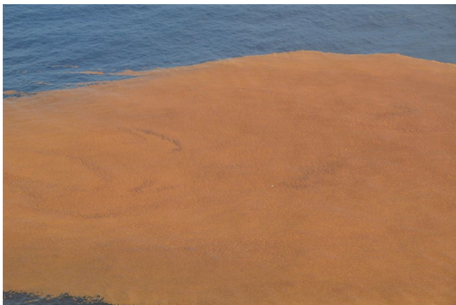
FIGURE 2. Floating mass of Sargassum off northern Brazil- closer aerial photograph.

The collected seaweeds were kept at low temperatures, in a freezer, and were then transferred to a 4% formaldehyde solution. Three primary lateral branches were analyzed for the description of the external and internal morphology, including qualitative and quantitative characteristics. Ten blades and ten air bladders from each branch were measured. Cross sections were made using razor blades. Taxonomic identification was based on descriptions provided in studies carried out in the western North Atlantic Ocean. Vouchers were deposited in the Herbarium of the Department of Botany, Institute of Biology of the Federal University of Rio de Janeiro (RFA).