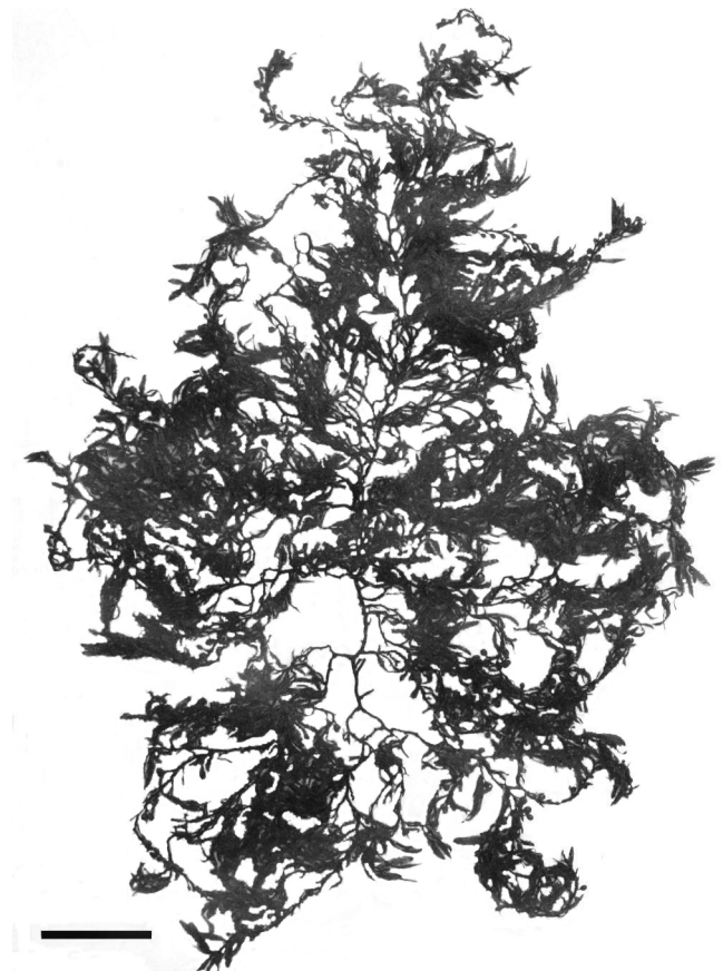
FIGURE 3. Sargassum natans from a floating mass off northern Brazil- primary lateral branch with its very dense first-order branches. Scale bar = 5 cm.

Based on these morphological characteristics, the offshore pelagic Sargassum analyzed was identified as S. natans . The Brazilian specimens are similar to the descriptions of S. natans from the North Atlantic Ocean in the width of the blades and also in the typically dentate margins of the blades. However, the material from Brazil showed less extended blades, being shorter than those described for the Caribbean and Florida. The Brazilian specimens differ from those described by Taylor (1960), Schneider and Searles (1991), Littler and Littler (2000) and Dawes and Mathieson (2008) with respect to the presence of spines on the axes of the primary lateral branches and their branches. Spines on the axes of the primary lateral branches are mentioned in the literature for S. fluitans (Table 1).