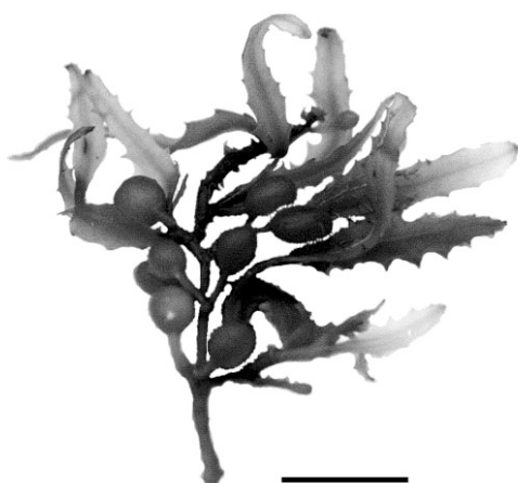
FIGURE 5. Sargassum natans from a floating mass off northern Brazil - apical portion of a branch. Note lanceolate blades with aculeate teeth. Scale bar = 1 cm.