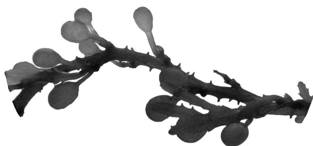
FIGURE 4. Sargassum natans from a floating mass off northern Brazil - axis of a primary lateral branch with air bladders. Note the spines. Scale bar = 10 mm.