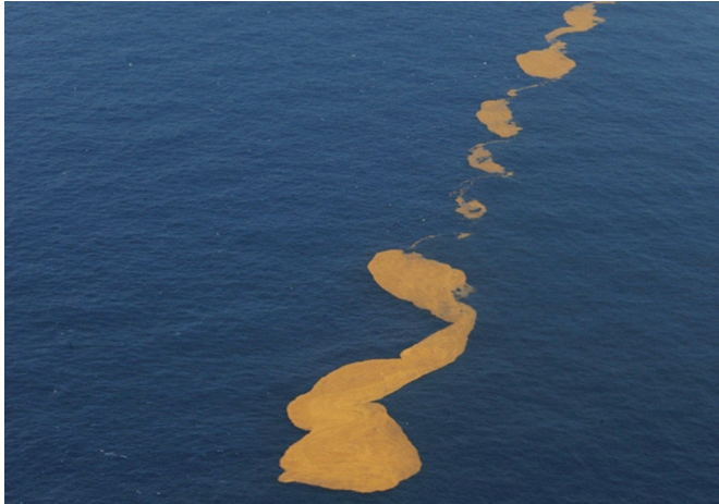
FIGURE 1. Floating mass of Sargassum off northern Brazil- more distant aerial photograph.

Brazilian Navy, when seaweeds were recognized as the component of those spills (Figure 2). On that date, the patch extended over about five nautical miles, in the northeast to southwest direction.