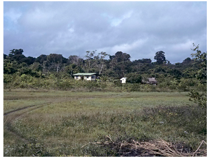
FIGURE 2. Airstrip and secondary forest at Baramita.

The majority of all specimens were collected along forest trails from the forest floor, from trail-side vegetation, at stream crossings and pools, and from riparian habitat along the Barama and Baramita Rivers. Rhinella marina , Scinax ruber , Ameiva ameiva , Kentropyx calcarata , Plica plica , Leptophis ahaetulla and Siphlophis compressus were also found in the cleared area around the air field and in the vicinity of dwellings. Larvae of Ameerega trivittata were collected from the backs of three adult males.