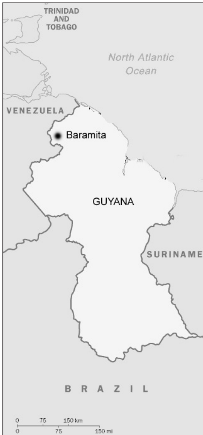
FIGURE 1. Map of Guyana showing location of Baramita.

Amphibians were collected in greater numbers than reptiles, although reptile diversity was higher (25 amphibian species in nine families vs. 28 reptile species in 13 families).