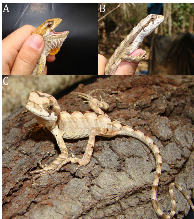
FIGURE 2. Specimens of Enyalius bibronii collected at Dizimeira and Serra Nova, municipality of Tenente Laurentino Cruz, state of Rio Grande do Norte, Brazil. A) Lateral view of gular flap of adult female (CHBEZ 2929); B) Adult male Enyalius bibronii (CHBEZ 2926); C) Juvenile of Enyalius bibronii (CHBEZ 3210).