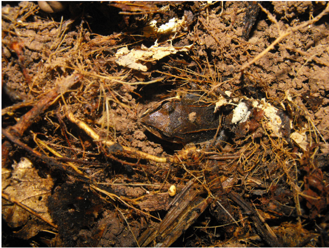
FIGURE 2. Leptodactylus didymus found vocalizing in a hole dug in primary forest floor next to the Juruparfí River, Feijó Municipality, Acre, Brazil.