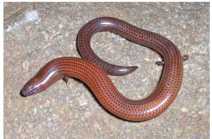
FIGURE 2. Photograph in life of Brachymeles elerae (PNM 9563), male, SVL = 71.9 mm.

Coloration: In preservative, the ground color of the body is light to medium brown, with each dorsal scale having a dark, chocolate-brown blotch on the posterior two thirds of the scale (Figure 2). Each blotch does not correspond to the scale boundary, but extends to the anterior edge of the next most posterior scale. The blotches are present around the entire body, and gradually reduce in size laterally. Ventral scales have smaller blotches restricted to the posterior one-third of each scale. Caudals and subcaudals have blotches nearly homogeneous in size, and only slightly reduced ventrally, thereby giving the appearance of a darker tail color. Limb scales are medium brown. Head scales lack a spotting pattern, have mottled light and medium brown coloration, and are consistent with the background body color. The rostral, nasal, supranasal, mental, and first supralabial scales have a medium gray coloration, lacking any brown color. In life, the body coloration is consistent with coloration in preservative; however, the ground color of the body appears orange-brown, and tail appears dark brown (Figure 2).