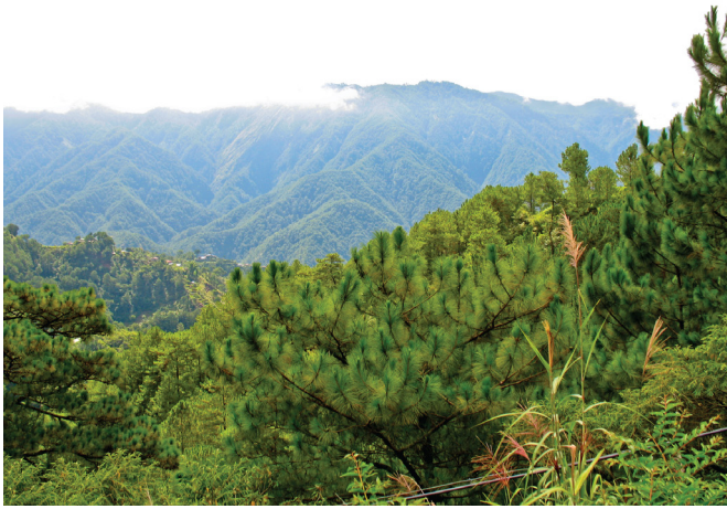
FIGURE 3. Mid-elevation habitat of Brachymeles elerae in Kalinga Province, Philippines.

documented to occur at higher elevations (incl. B. apus , B. lukbani , and B. muntingkamay ). Whether this species possesses a wider geographical distribution in northern Luzon Island is unknown. I consider the conservation status of the new species “data deficient,” pending the collection of additional information on distribution and habitat requirements of this unique species.