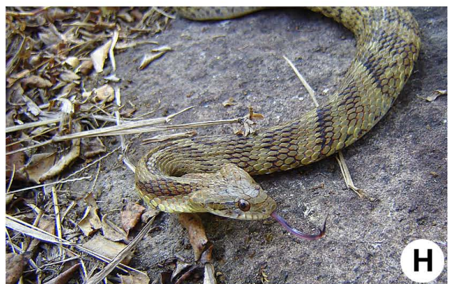
FIGURE 4. Specimens from Parque Natural Municipal da Taquara: A - Liophis miliaris ; B - Liophis reginae ; C - Leptodeira annulata ; D - Oxyrhopus petola ; E - Sibynomorphus newwedii ; F - Siphlophis compressus ; G - Thamnodynastes sp.; H - Xenodon newwedii .