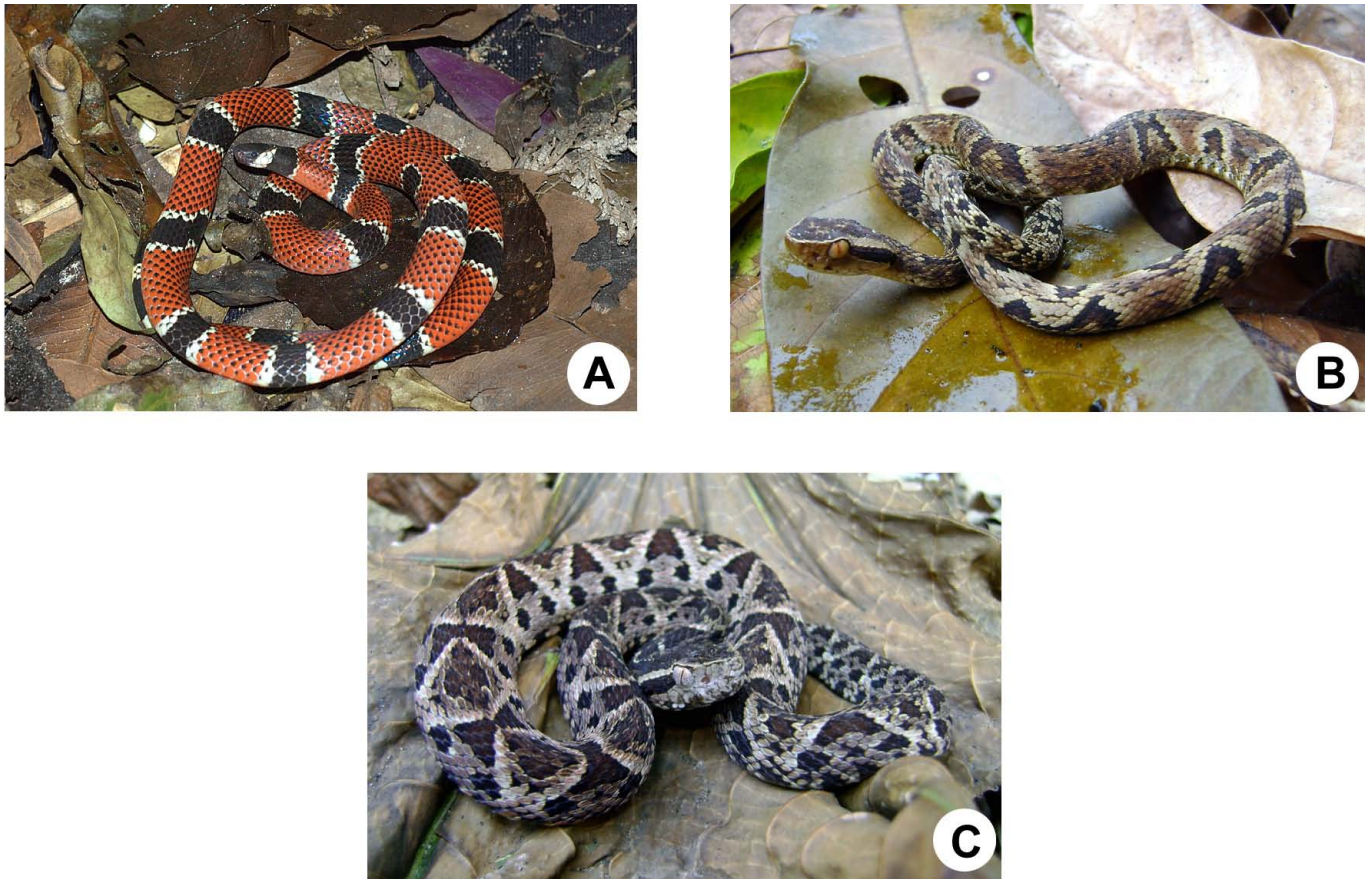
FIGURE 5. Specimens from Parque Natural Municipal da Taquara: A - Micrurus corallinus ; B - Bothropoides jararaca ; C - Bothrops jararacussu .