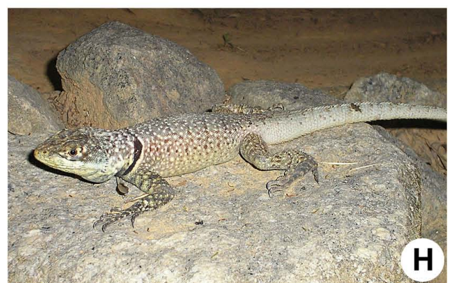
FIGURE 2. Specimens from Parque Natural Municipal da Taquara: A - Amphisbaena microcephala ; B - Ophiodes striatus ; C - Gymnodactylus darwini ; D - Hemidactylus mabouia ; E - Mabuya agilis ; F - Ameiva ameiva ; G - Tupinambis meiriana ; H - Tropidurus torquatus .