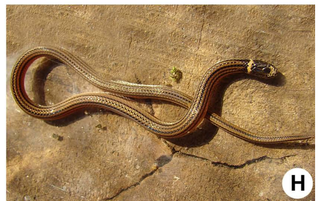
FIGURE 3. Specimens from Parque Natural Municipal da Taquara: A - Boa constrictor ; B - Chironius bicarinatus ; C - Chironius fuscus ; D - Chironius exoletus ; E - Pseustes sulphureus ; F - Spilotes pullatus ; G - Echianthera cephalostriata ; H - Elapomorphus quinquelineatus .