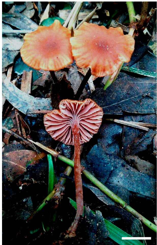
Figure 1. Laccaria fraterna FACEN 003337, macroscopic characters. Scale = 20 mm.

Basidiospores (7–) 8–9 (–10) × 7–9 μm; when young, appearing subglobose when viewed laterally, appearing globose in front view; hyaline; walls up to 1 μm thick, ornamented with spines 1–1.5 μm; inamyloid. Basidia (40–) 42–50 × 7–10 μm, clavate, 2-spored, thin-walled. Pleurocystidia and cheilocystidia not seen. Hymenophoral trama regular, consisting of parallel hyphae 5–15 μm in diameter, septate. Pileipellis a cutis, with repent