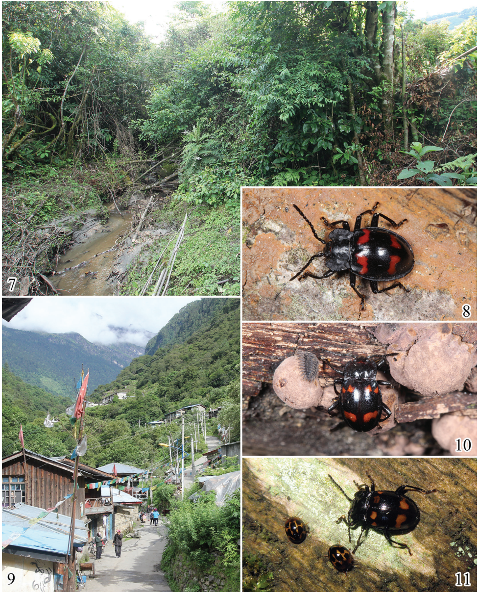
Figures 7–11. Habitats of Brachytrycherus species. 7 large clump of Fagaceae plants of collecting site in Xizang, China 8 male of B. curviantennae sp. n. (arranged) 9 village of collecting site in Xizang, China 10 male of B. conaensis sp. n. and larva on the wood pile 11 female of B. conaensis sp. n. feeding on the lichen growing on wood.

pronotum and 1.2–1.3 times as wide as pronotum, sides curved, widest near 1/2 length of elytron; densely and coarsely punctate; humeri rather prominent. Each elytron with two transverse, irregular in shape red maculae. Anterior elytral macula