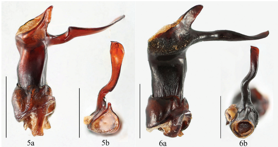
Figures 5–6. Aedeagus 5 B. conaensis sp. n.; 6 B. curviantennae sp. n. a = lateral view, b = apical view. Scale bars 1 mm.

Wen-Xuan Bi leg. (MHBV); 1 female, Xizang, Medgo, Beibeng, Gelincun, 3.VIII.2014, Wen-Xuan Bi leg. (CBWX).