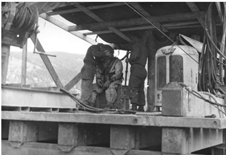
Figure 1. U.S. Army pier divers searching for the OKW/ Chi archives in the Schliersee, September 1945.

All documents and captured materials shipped back to Bletchley Park were registered and processed, given a library number according to a standard classification, given a suitable title in English and German, and if necessary, a synopsis was written and attached. For example, seized OKW/ Chi documents were numbered