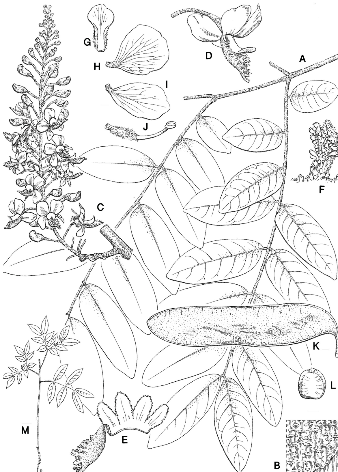
FIGURE 1. Coulteria mollis showing many of the important features of the genus. A. part of a bipinnate leaf; B bark detail; C racemose inflorescence; D flower lateral view; E calyx opened out, inner surface, with lower cucullate sepal reflexed; F detail of the glandular-pectinate margin of the lower cucullate sepal; G median petal; H upper lateral petal; I lower lateral petal; J stamen of a male flower; K laterally compressed fruit; L seed; M seedling, first leaf pinnate, subsequent leaves bipinnate. A & J from Lewis & Hughes 1714; B, C, E–K, L & M from Lewis & Hughes 1713; D from photo of C.E. Hughes 324. Drawn by Eleanor Catherine.