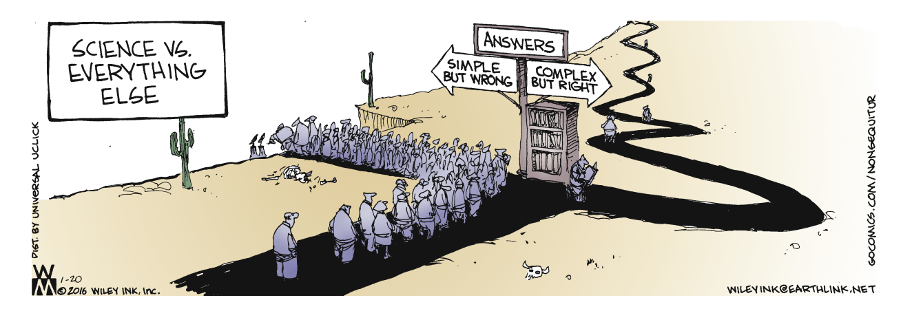
NON SEQUITUR © 2016 Wiley Ink, Inc.. Dist. By UNIVERSAL UCLICK. Reprinted with permission. All rights reserved.