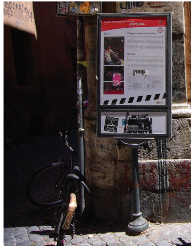
Figure 2. Signs describing film locations in Roma

The use of fictional or imaginary representations contributes to this phenomenon. It simultaneously reinforces and spatially defines it. Indeed, fiction contributes to recycle/renew those myths and clichés by making them alive, through their embodiment both by the characters and by the places. Therefore, it is not surprising that modern tourist guides are full of quotes from fiction about places to visit, and artistic and literary representations of these places. Libraries specializing in travel present systematically and in locational proximity maps and guides, novels and essays related to the destinations proposed. It is now commonplace, before or after a trip, to view films set in the places visited. Some specialized books map out film locations (Alleman, 2005a; Alleman, 2005b; Katz, 2005; Hellman et al. , 2006; Reeves, 2006; Hellmann and Weber-Hof, 2007). In situ installations are also created. For instance, in Collioures, it is possible to contemplate paintings from the fauvists in locations where they were actually painted 10 (Figure 1). In Roma, signs describe places where films were