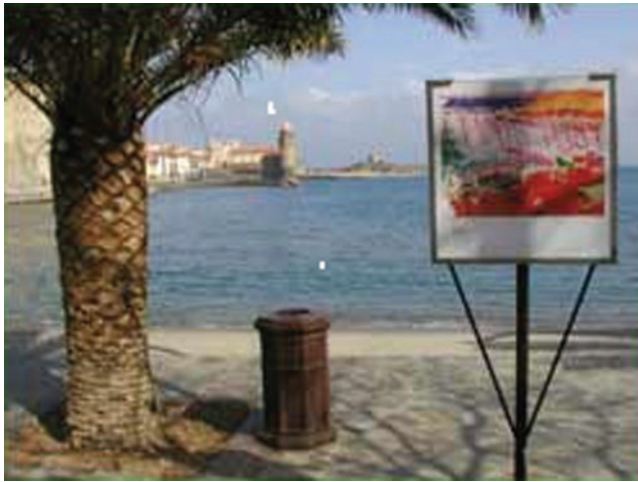
Figure 1. Paintings from the fauvists in Collioures (France)