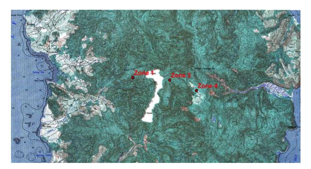
Figure 2. Map of sampling points, representing Zones 1, 3 and 4, overlaid on a topographic map (large white region is labeled "clouds") (NAMRIA 2017)