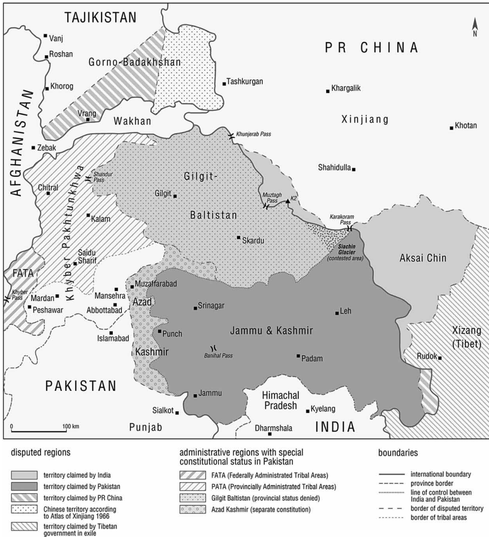
Figure 1. Disputed territories and constitutional peculiarities in Western High Asia. Source: The figure is a modified version from Kreutzmann (2013, 42). Design and copyright: Hermann Kreutzmann.

meaning the Indian refusal to accept a referendum about Kashmir’s future, the military confrontation along the ‘line of control’, and the constantly growing number of victims on both sides – has led to a situation where a number of actors and stakeholders attempt to seek other options that are widely discussed in the region. Outside political scientists such as Robert Kaplan perceive Kashmir as a pawn suiting power politics within India and Pakistan: