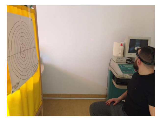
Fig. 6. The participant closes eyes and rotates the head then returns to the starting position. Between attempts it is allowed to open eyes.

Fig. 5. Starting position for the test. The participant takes the free position, with feet flat and set back in a chair. In this position the settings of the laser diode are adjusted so that the beam fell on the center of the target.