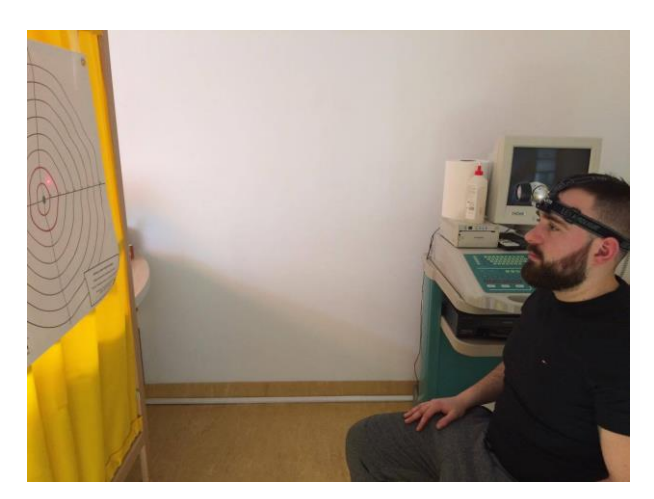
Fig. 7. End position of the movement can be marked on the board, for example with plastelin or washable marker