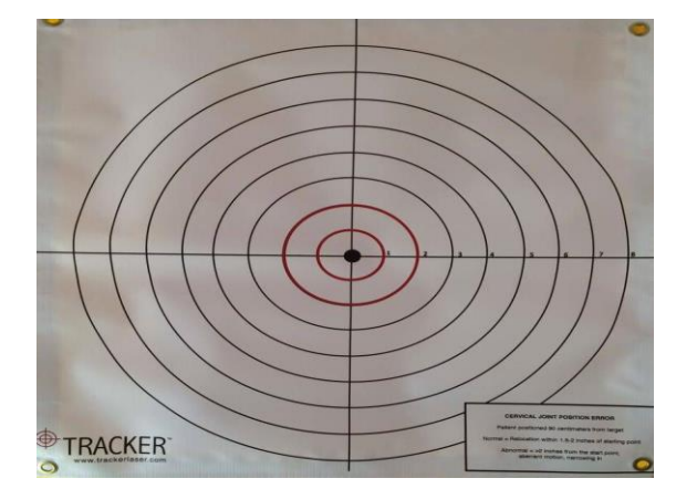
Fig. 2. Diagnostic mat with a shield. The two inner circles, marked in red define permissible error repositioning.