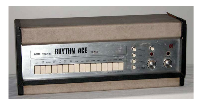
Figure 3. Ace Electronics' FR-1 Rhythm Ace<sup>5</sup>

Shortly after the Wurlitzer Sideman, Ace Electronics began to prototype a new rhythm machine, the R1 Rhythm Ace, offering sixteen preset patterns that could be mixed together by pressing two buttons simultaneously allowing for over one hundred rhythm combinations. Ace changed the name to the FR-1 Rhythm Ace<sup>5</sup> ( Figure 3 ) in 1967 when it was released for the commercial market.