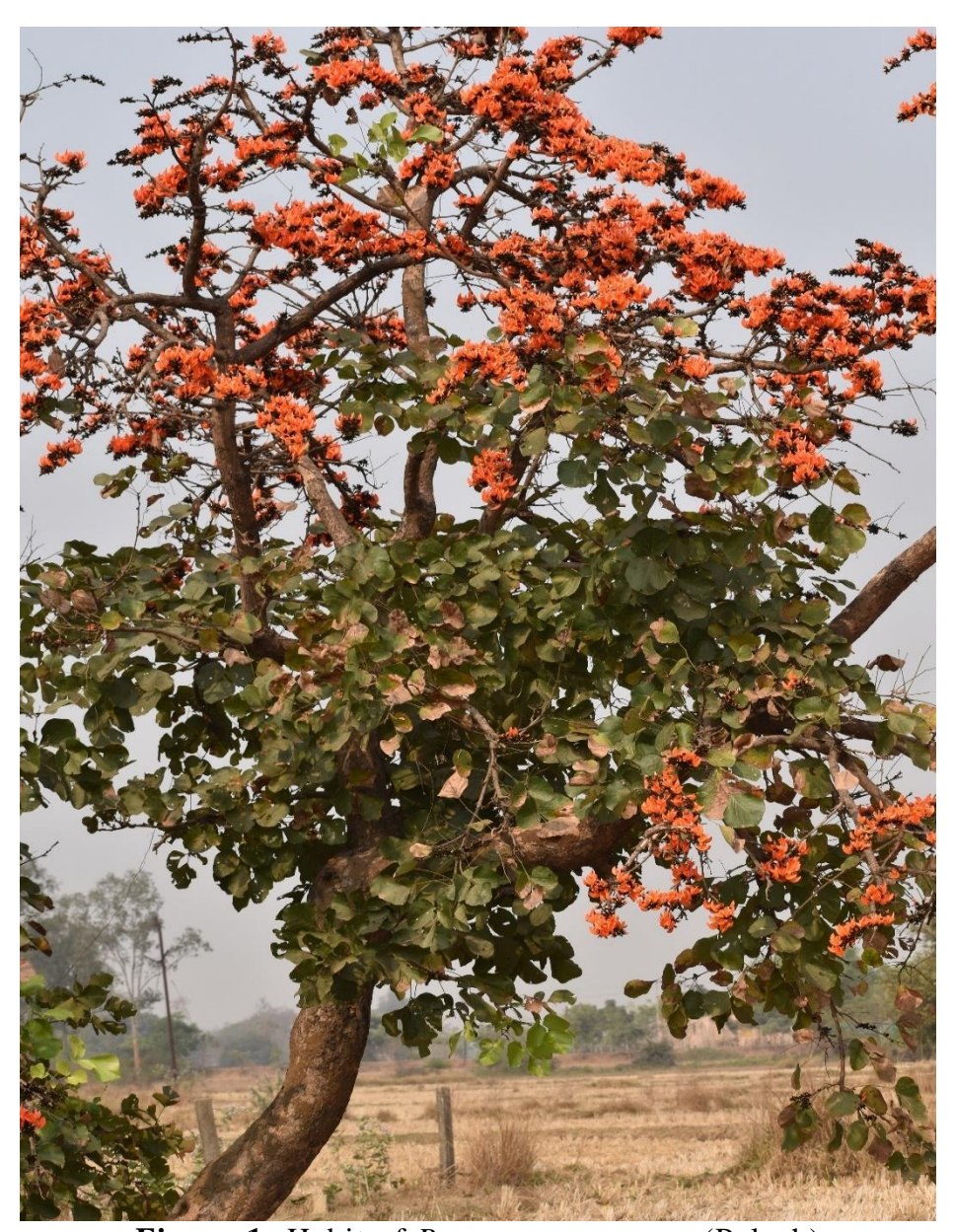
Figure 1: Habit of Butea monosperma (Palash)