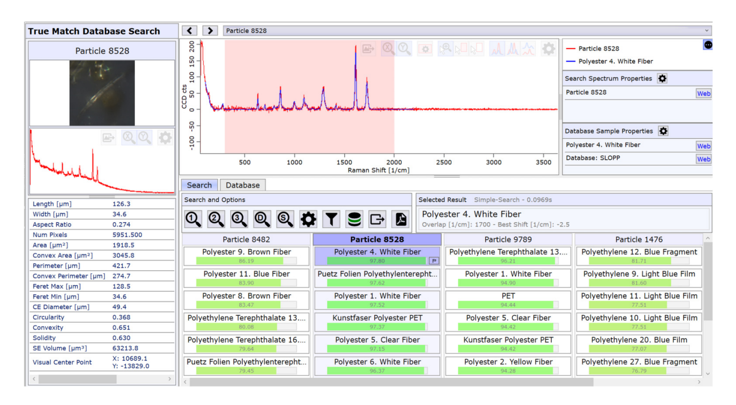
Fig. 2. Example of a microplastic particle identified by Raman spectroscopy using a combination of several spectral databases (Cabernard et al. 2018; Munno et al. 2020; von der Esch et al. 2020a). Left side: Particle image, raw Raman spectra, and particle details derived by image analysis. Right side: Processed spectra (red) and assigned library spectrum (blue) for the selected particle and reference spectra (highlighted in violet) combined with material name and further information.