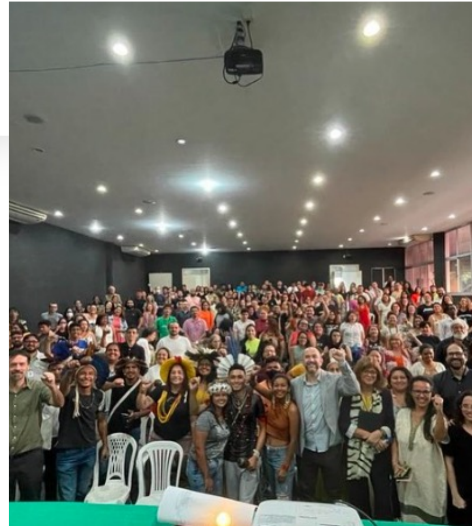
PH: CLACSO Forum of participatory Science: "Social Movements and Territories for Life" in Fortaleza, Brazil.