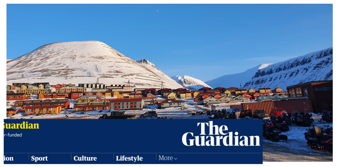
s Asia Australia Middle East Africa Inequality Global development