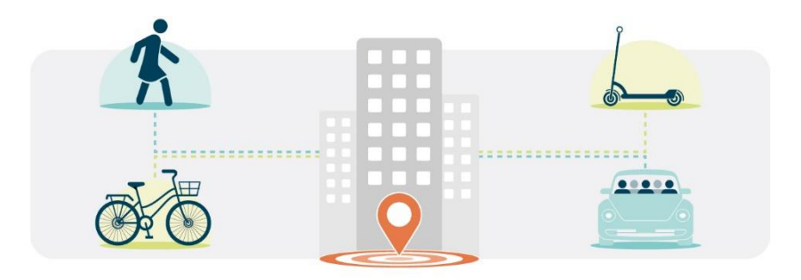
promoting sustainable mobility