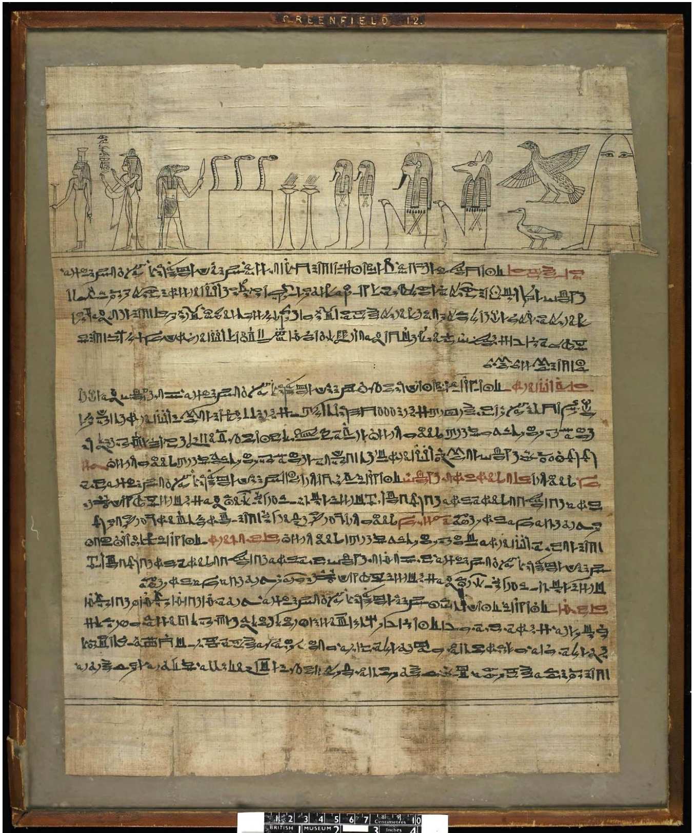
Figure 2. Sheet 12 of the Greenfield Papyrus.