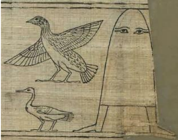
Figure 4. Close-up of Sheet 12 of the Greenfield Papyrus (from Fig. 2) showing Medjed. Just in case, he is the one on the right.