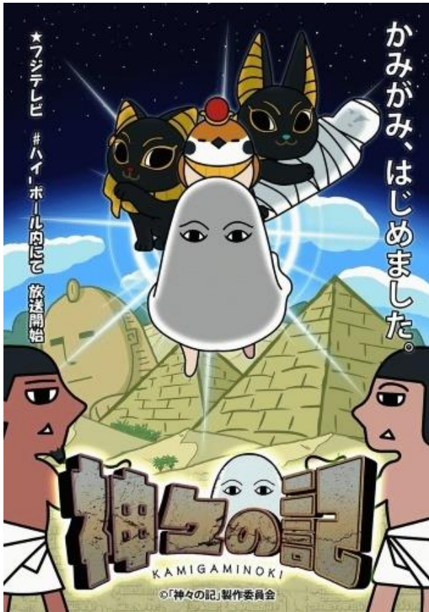
Figure 12. The cute gods of Kamigami no Ki .