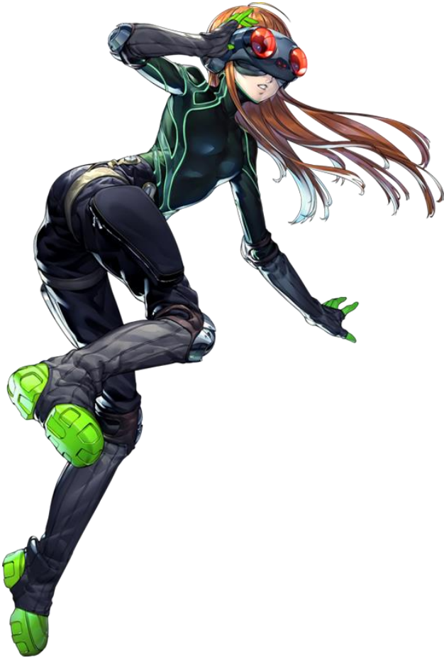
Figure 1. Support's on the way!.

monsters, from Egypt or elsewhere. And so I decided to investigate the matter of Medjed's popularity in Japan. But before getting into that, let us learn a little bit about this god.