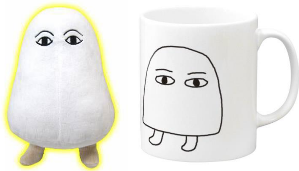
Figure 7. Left: Plush Medjed (lasers not included). Right: Medjed mug. May this coffee smite your fatigue away!

2017). Visitors to the Tokyo exhibit quickly took notice of Medjed’s strangely manga-like appearance and photos of him (on the papyrus) started to circulate on Twitter (Stimson, 2015). As often happens on the Internet, fan art of Medjed started to pop up: there were drawings, comics, toys, cookies, you name it. Soon, any Japanese Medjed fan was able to buy merchandise of the god (Fig. 7).