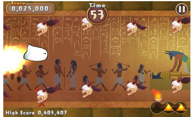
Figure 8. Flying Mr. Medjed . Screenshot of the game.

the same year, Medjed appeared on the popular Puzzle & Dragons game (as the character Medjedra; Fig. 9). In this case, the god’s power to shoot “forth light from his eyes” is a pair of laser beams, like those earlier fan art pieces.