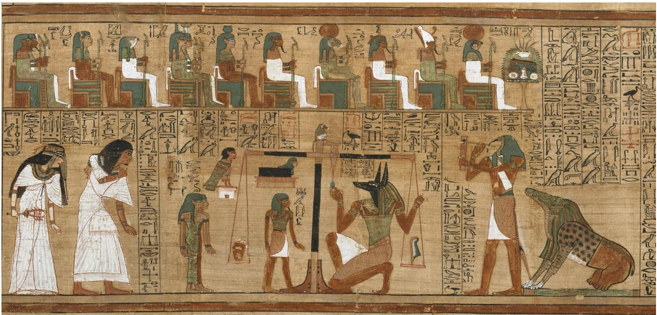
Figure 6. Frame 3 of the Papyrus of Ani (19 th Dynasty, ca. 1250 BCE), showing the Judgement scene, also known as “weighing of the heart”. Anubis performs the weighing and Thoth records the proceedings. Ammit waits close by in case she has to devour the deceased’s heart.

So now that this is out of our way, let us return to the original question. Why was Medjed chosen for Persona 5 ? What does he have to do with Japan anyway?