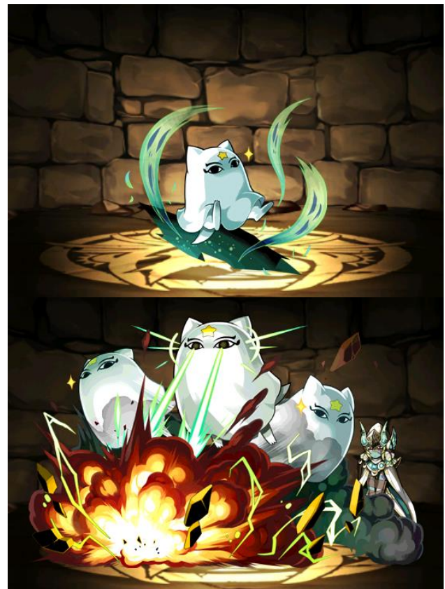
Figure 9. Medjedra, from Puzzle & Dragons .