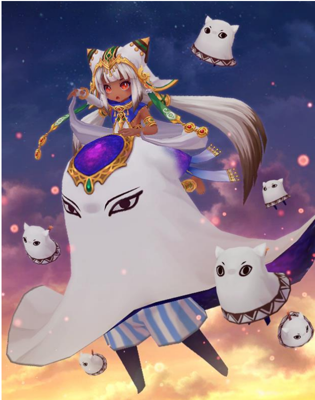
Figure 10. Zephyrine and Nakama/Medjed, from Aura Kingdom .

Medjed was also included in the MMORPG Aura Kingdom in a manner very similar to that of Puzzle & Dragons (with lasers), but this time under the name Nakama and accompanying a character named Zephyrine (Fig. 10).