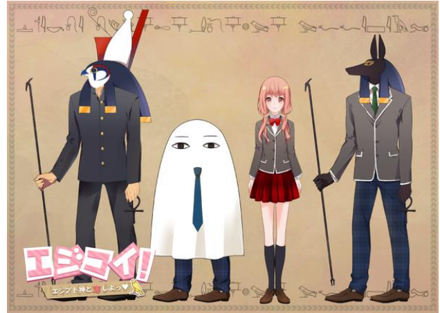
Figure 11. Characters from Ejiko!

Then — and perhaps unavoidably when dealing with Japan — Medjed starred in a dating sim. The game is called Ejiko! (Fig. 11), which translates to something along the lines of “Egy-love”. The player takes control of a high school girl looking for romance with one of her classmates, who all happen to be Egyptian deities. As weird as this game may sound, some people must have really liked it, because it is getting a sequel soon.