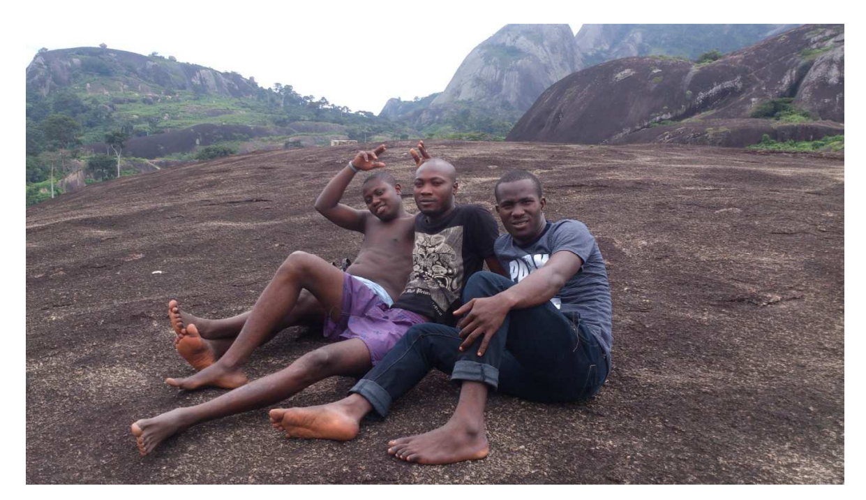
Undergraduate at Idanre Hills on Excursion