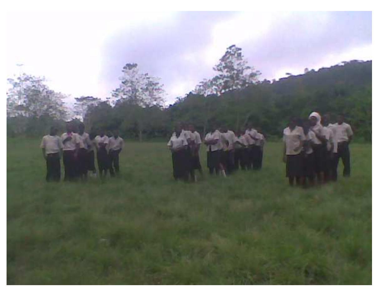
Secondary School Students on Excursion.