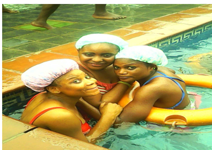
Undergraduates At Ikogosi-Warm Spring Swimming Pool During Our Excursion