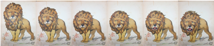
Fig. 1: What you see is the different states of the movement of an animated paper lion triggered by the reader, who is pulling a strip of paper. Source: Meggendorfer, Lothar. Nah und Fern: ein Tierbilderbuch zum Ziehen . München: Braun & Schneider, 1887.

The present project deals with paper-objects, too. However, these objects serve a third dimension. Pop-up books or movable books (see fig. 1) contain what you could call an interface. Whereas one can talk of interaction between the reader and the object as early as reading is concerned – reading a multi-paged book makes necessary the turning of pages 5 – the objects of our project are rather machines than books.