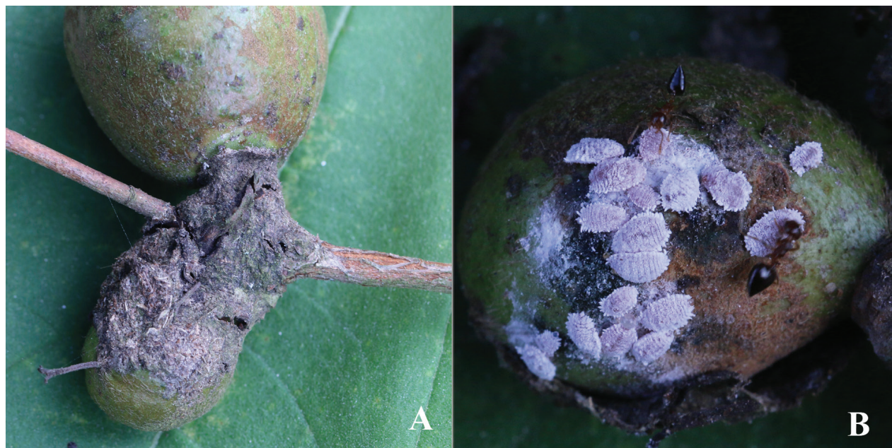
Figure 1. Planococcus camelliae Zhang, sp. nov.: A an ant carton that harbours mealybugs inside B mealybugs found inside ant carton with tending ants.

setae, each 105–150 \mu\text{m} long. Cerarii numbering 18 pairs. Anal lobe cerarii ( C_{18} ) each bearing two conical setae, each seta 20–24 \mu\text{m} long, accompanied by 2–5 auxiliary setae and 15–25 trilocular pores, situated on a small slightly sclerotised area. Other cerarii, sometimes situated on small prominences, each bearing two conical setae, occasionally only with one conical seta, but ocular pairs ( C_3 ) sometimes with three conical setae, all cerarian setae conical and with flagellate tips, accompanied by 4–10 trilocular pores. Discoidal pores smaller than the trilocular pores, sparsely but evenly distributed.