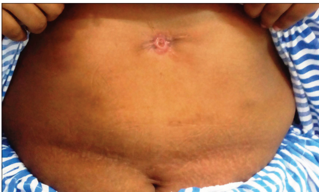
Figure 1: Preoperative photograph of sinus tract at epigastric port site with scanty serous discharge

Laparoscopic procedures are being increasingly performed worldwide at most surgical centers today. They are