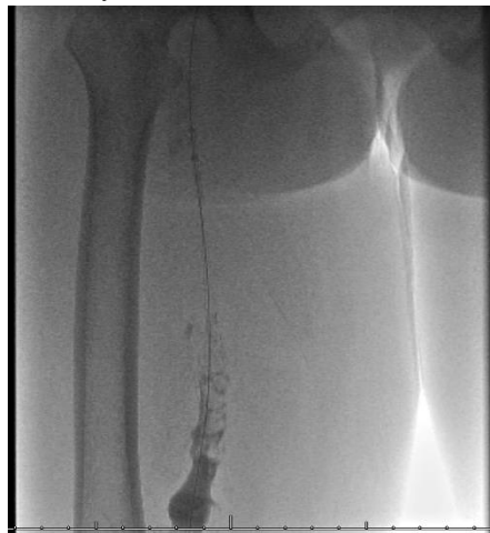
Figure 3: Venogram of the left femoral and iliac shows diffuse multiple filling defects representing clots occluding the superficial and common femoral veins with total occlusion of the left iliac vein.

left side (Figure 3). A venoplasty 12 mm balloon was used with a very good response and a follow-up venogram showed clear patency of the iliac. The final venogram showed clear patency and no residual clot throughout the superficial femoral vein, common femoral vein, and iliac vein with free flow into the inferior vena cava (Figure 4). No stenting is required for the left iliac vein. The patient also underwent an IVC filter insertion on the same day. The procedure was successful, and there were no complications. A retrievable IVC filter was deployed in the infrarenal portion of the inferior vena cava.