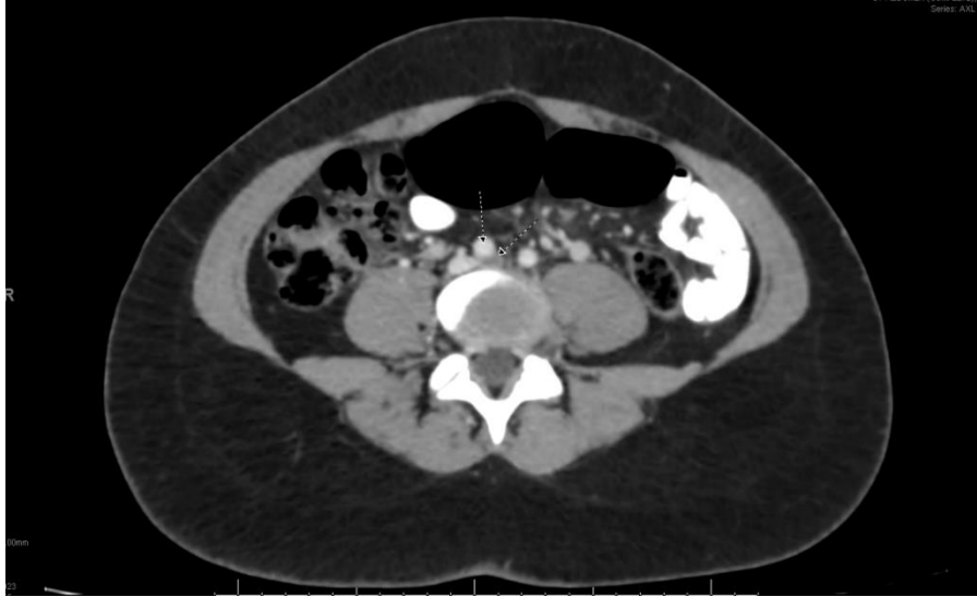
Figure 2: Compression of the left common iliac vein where it passes behind the left common iliac artery suggesting of May Thurner Syndrome

A few days later the patient underwent mechanical thrombectomy and lysis of a vascular clot. The procedure was successful, and there were no complications. A Venogram of the left femoral and iliac showed diffuse multiple filling defects representing clots occluding the superficial femoral vein and common femoral vein with total occlusion of the left iliac vein. Over guidewire mechanical thrombectomy using the AngioJet DVT kit complete suction of the thrombus was carried out. A Venogram of the iliac vein on the left side demonstrates severe stenosis at the common iliac artery distally and diffuse narrowing throughout the common iliac artery on the