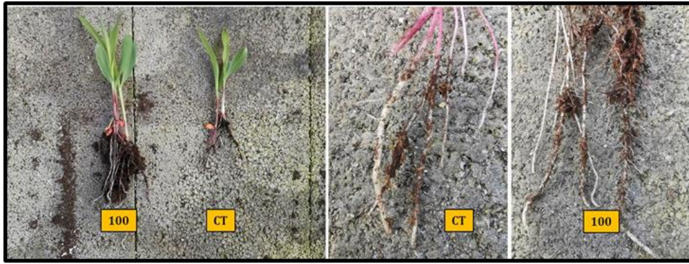
Figure 4 Effect on root growth between 100% peat (CT) and 100% biohumus (100)