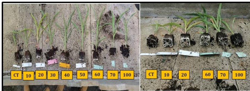
Figure 3 Effect of different biohumus content in growing medium on root growth