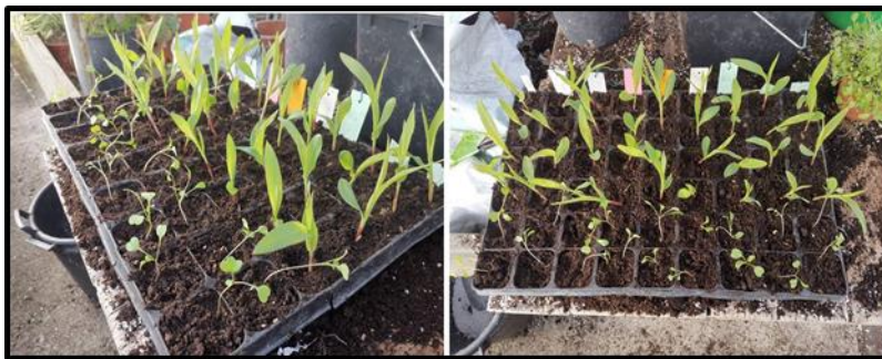
Figure 1 Details of the experiment at CREA-OF

This research aims to evaluate the biostimulant potential of biohumus in different substrate replacement rates on the growth of Zea mays seedlings.