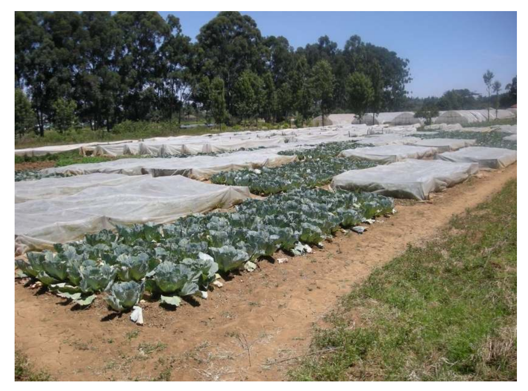
Fig. 1. Layout of the experiment showing agronet covers on the cabbage crop

The field was manually tilled using hand hoes to approximately 20 cm depth and prepared to a fine tilth using rakes. Healthy Gloria F1 hybrid cabbage seedlings produced under agronets were then transplanted at a spacing of 40 cm by 40 cm giving a total of 75 plants per plot. Triple superphosphate (45% P<sub>2</sub>0<sub>5</sub>) fertilizer was used at planting at the rate of 225 kg/ha [16]. Agronets were then mounted on each of the net protected plots immediately after transplanting. A two