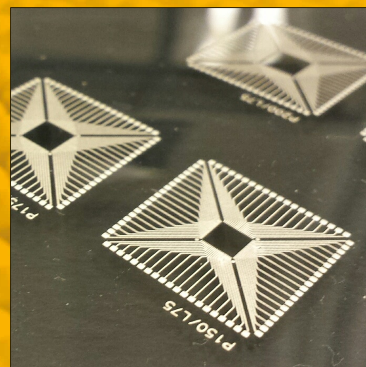
UV cured IPC-131 silver ink printed on PET