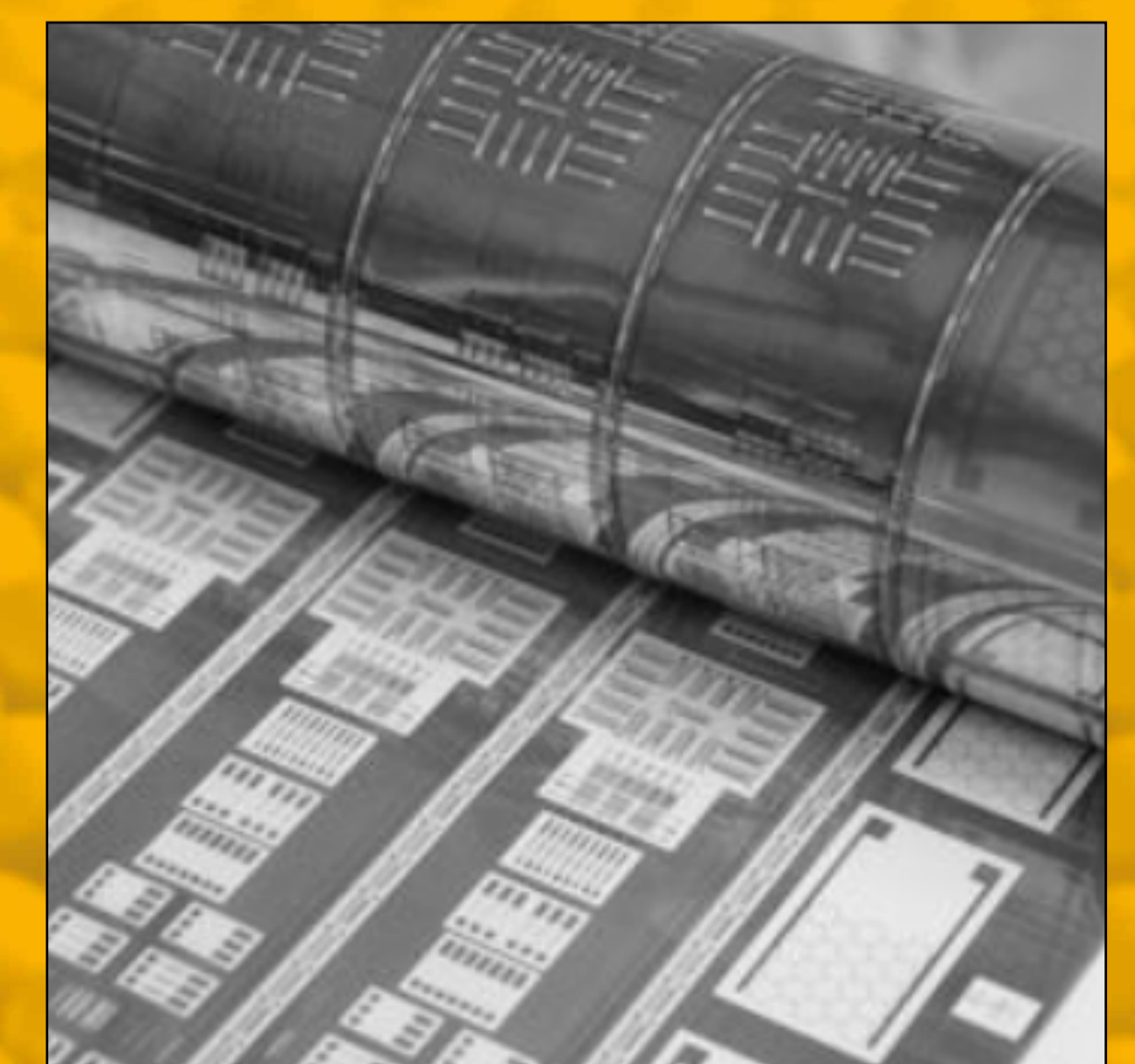
Multilayer printed electronics