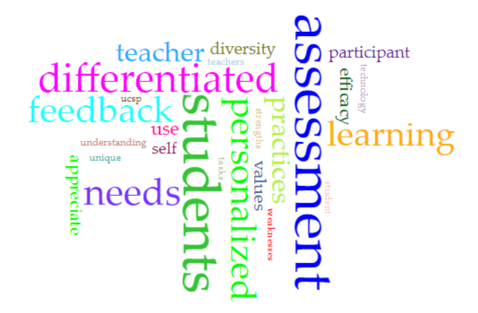
Figure 2. Teachers' Perception of DA Using Voyant Tool

Figure 2 presents Teachers' Perceptions of DA using Voyant Tool. The Voyant tool reveals based on the frequent words used in the corpus that differentiated assessment addresses students' personalized needs or diverse needs and diversity and that learning feedback from the teacher could be immediately and properly conducted and it also values the weaknesses and strengths of students as teachers emphasize this for continuous improvement and learning.