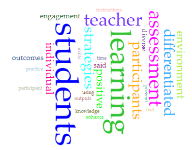
Figure 6. Teachers' Recommended Strategies to Improve DA Using Voyant Tool

write self-reflection. We can also allow students to select from varied options and choose the best one for them based on their interests. We also hope that there is a technology or even Wi-Fi connection so that they can search for diverse sources of information with ease and autonomy."