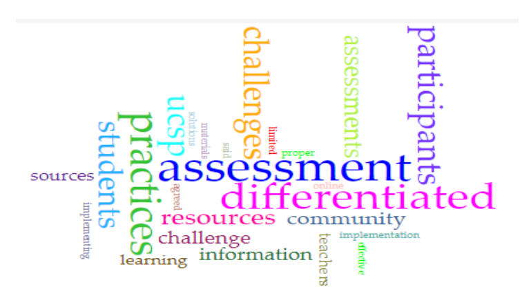
Figure 5. Students' Challenges Using Voyant Tool

Figure 5 presents the Students' Challenges using Voyant Tool. The Voyant Tool reveals that students' challenges include primarily sources and resources. It is also highlighted that there are limited sources for learning and information on the subject.