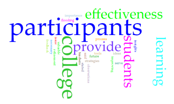
Figure 7. Students' Recommended Strategies to Improve DA Using Voyant Tool

Figure 7 presents the Students' Recommended Strategies to Improve DA using Voyant Tool. The Voyant Tool reveals that students' recommended strategies to improve DA include criticism in preparation for college life, using valuable tools, and improving and refinement of feedback and insights.