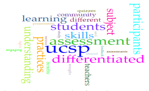
Figure 3. Student's Perception of DA Using Voyant Tool

Consistently, participants A, B, F, and H emphasized that students found differentiated assessments and practices, such as quizzes, role play, and essays, to be more engaging and motivating. This positive response suggests that the use of differentiated assessments enhances student engagement and motivation within the UCSP subject. They consistently mentioned that "We find it more engaging and feel motivated using differentiated assessments and practices like quizzes, roleplay, and essays."