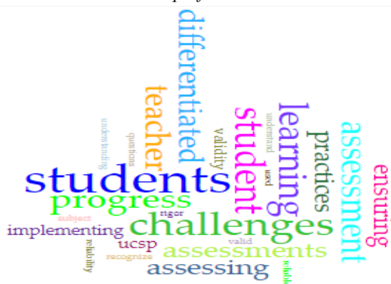
Figure 4. Teachers' Challenges Using Voyant Tool

providing valid and reliable measures of student learning. I understand the importance of accurately assessing my students' progress and knowledge, while also ensuring that the assessments align with the differentiated approaches used in the classroom. Rubric tool is constantly used in the lesson so that students know what to perform in each task."