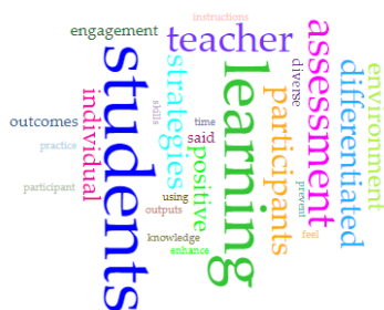
Figure 6. Teachers' Recommended Strategies to Improve DA Using Voyant Tool

write self-reflection. We can also allow students to select from varied options and choose the best one for them based on their interests. We also hope that there is a technology or even Wi-Fi connection so that they can search for diverse sources of information with ease and autonomy.”