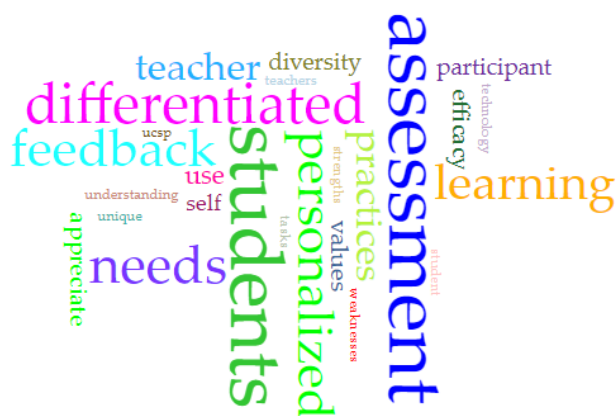
Figure 2. Teachers' Perception of DA Using Voyant Tool

Figure 2 presents Teachers' Perceptions of DA using Voyant Tool. The Voyant tool reveals based on the frequent words used in the corpus that differentiated assessment addresses students' personalized needs or diverse needs and diversity and that learning feedback from the teacher could be immediately and properly conducted and it also values the weaknesses and strengths of students as teachers emphasize this for continuous improvement and learning.