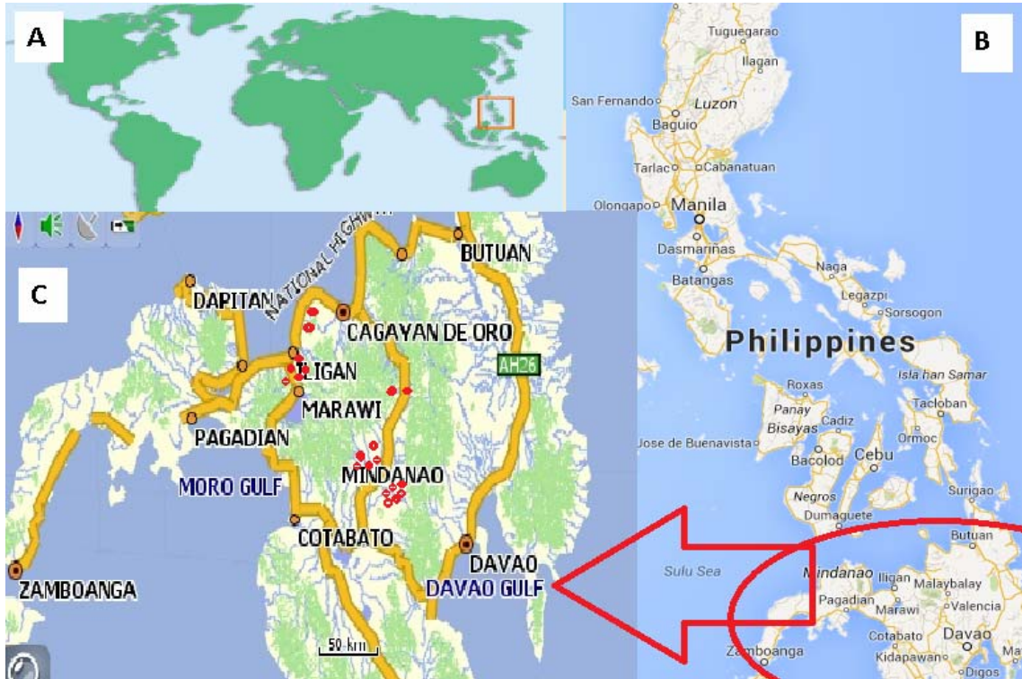
Figure 1. Map of the world (A) ( www.marloncabilan.wordpress.com 2012) and the Philippines (B) ( www.google.com.ph/maps 2015) showing the location of 19 caves (red dots) (C) ( www.car-navi.ph 2010).