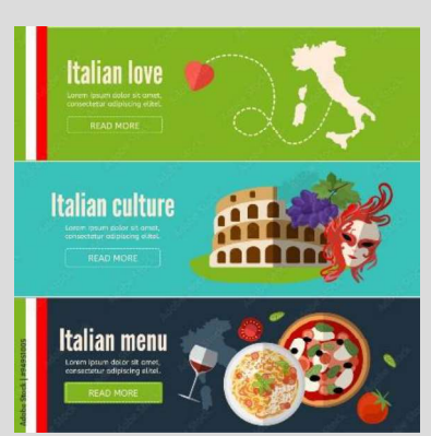
Figure 7: Web banners with national colours of Italy