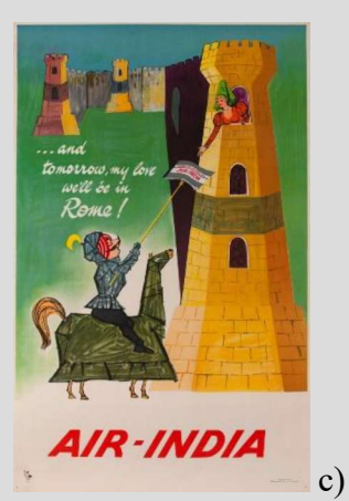
Figure 3: Creative in travel airline ads: a) Qantas Australian; b) Aaron Fine, travel poster for Pan American, 1950s; c) Air India, 1962 (www.pinterest.com)

Lorenzo Ottaviani says that his book "Travel Italia" is a must-have gift for anyone interested in the art of the poster. Organized by region, it features Italy's foremost tourist destinations by drawing on an unparalleled collection of over 150 vintage posters and paintings from 1920 through 1960 commissioned by the Italian National Tourism Agency. Each vibrantly coloured, hand-rendered poster designing features a particular destination, ranging from the main art cities, such as Florence and Bologna, to lesser known alpine jewels, such as