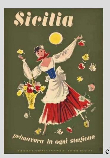
Figure 2: Creative in travel ads: a) Mino Delle Site, travel poster "Summer in Italy", 1952; b-c) Mario Puppo, vintage Italian travel posters, 1955 (www.pinterest.com)