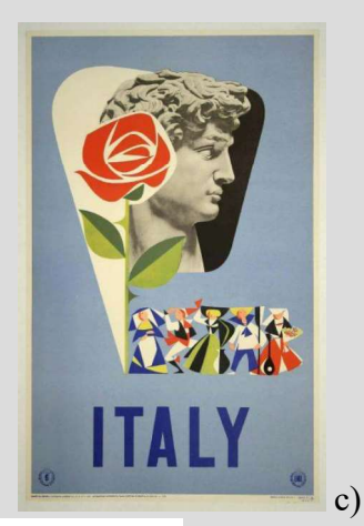
Figure 4: Stylistics of travel ads: a) Postmodernist collage; b) Pop Art; c) Postmodernism, 1960s (https://plakatkunst.com/collections/italien)