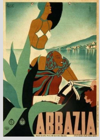
Figure 1: a) Realism, 1826; b) Art Nouveau, 1893; c) Art Deco, 1930 (www.pinterest.com)