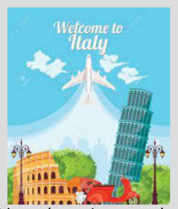
Figure 5: Visual stereotype of the second half of the 20th cent.

Modern travel poster in comparison with the last century one seems to be repetitive, sometimes even stereotypical. Spectacular photos of liners and views flowing from one image to another and then, from one travel agency campaign to another, reveal a tendency for today's poster with the absence of creative visualization of advertising ideas, compositional techniques or images of countries. The same is true with web resources including sites and banner advertising. Digital media has a clear tendency to use photos that are lack of a