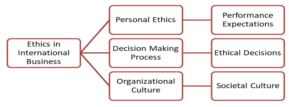
Fig. Ethics in International Business

First and foremost, ethics are our distinct reward in our day-to-day life as well in our professional life. Being morally upright is an indication of virtue and empathy. These ethics promotes feelings for generosity towards all, that can empower internal self-respect and fortitude. Companies that operate their global operations ethically also enjoy increased profitability because they draw clients and partners who place a high value on ethics in international commerce. The key findings of this research will provide significant parameters and cover similar gaps in the literature. This research provides a comprehensive model for analysing the importance of ethics in international businesses.