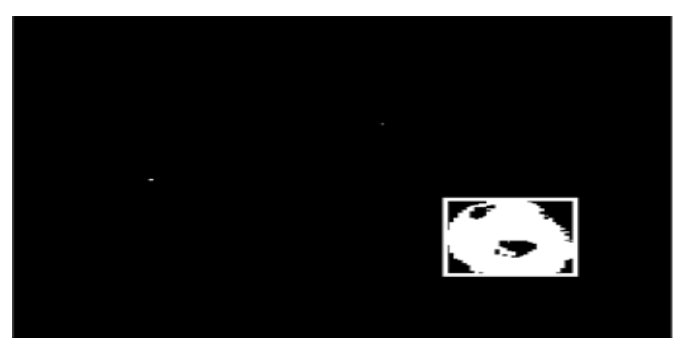
Fig. 4: Binary image of the red-colored object

The output image "a" replaces the pixels in the input image with luminance greater than the preset value (here 0.18) with one (white) and the other pixels with value zero (black) [14]. Figure 4 given below shows the binary image obtained as output.