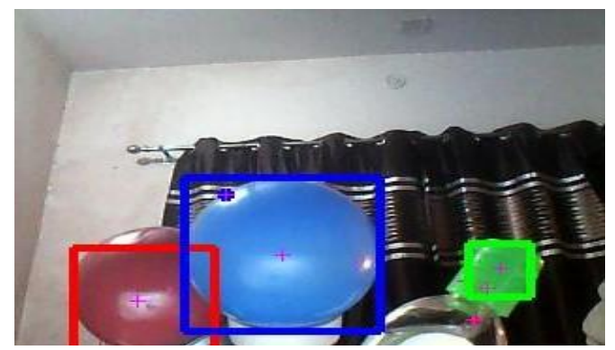
Fig. 5: RGB detection of different objects using inbuilt laptop camera

The RGB (Red, Green, and Blue) colours had been detected as shown in figure 5 given below. The red, green, and blue colours are detected and enclosed in a rectangular box with their respective colours. Objects are detected only when the luminence is greater than the preset value. Here the preset value is 0.18 which can be changed as per one's requirements and choices. On changing the preset value, the outputs for the binary image changes as well.