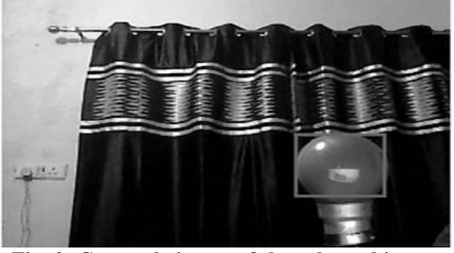
Fig. 2: Greyscale image of the coloured image

The image returned after executing this function is shown in the Fig. 2 given below-: