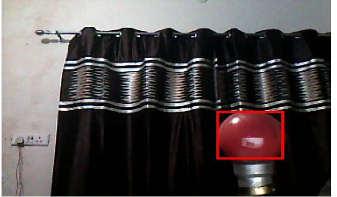
Fig.1: Snapshot image of the red-colored object

The image returned is shown in the Fig. 1 given below-: