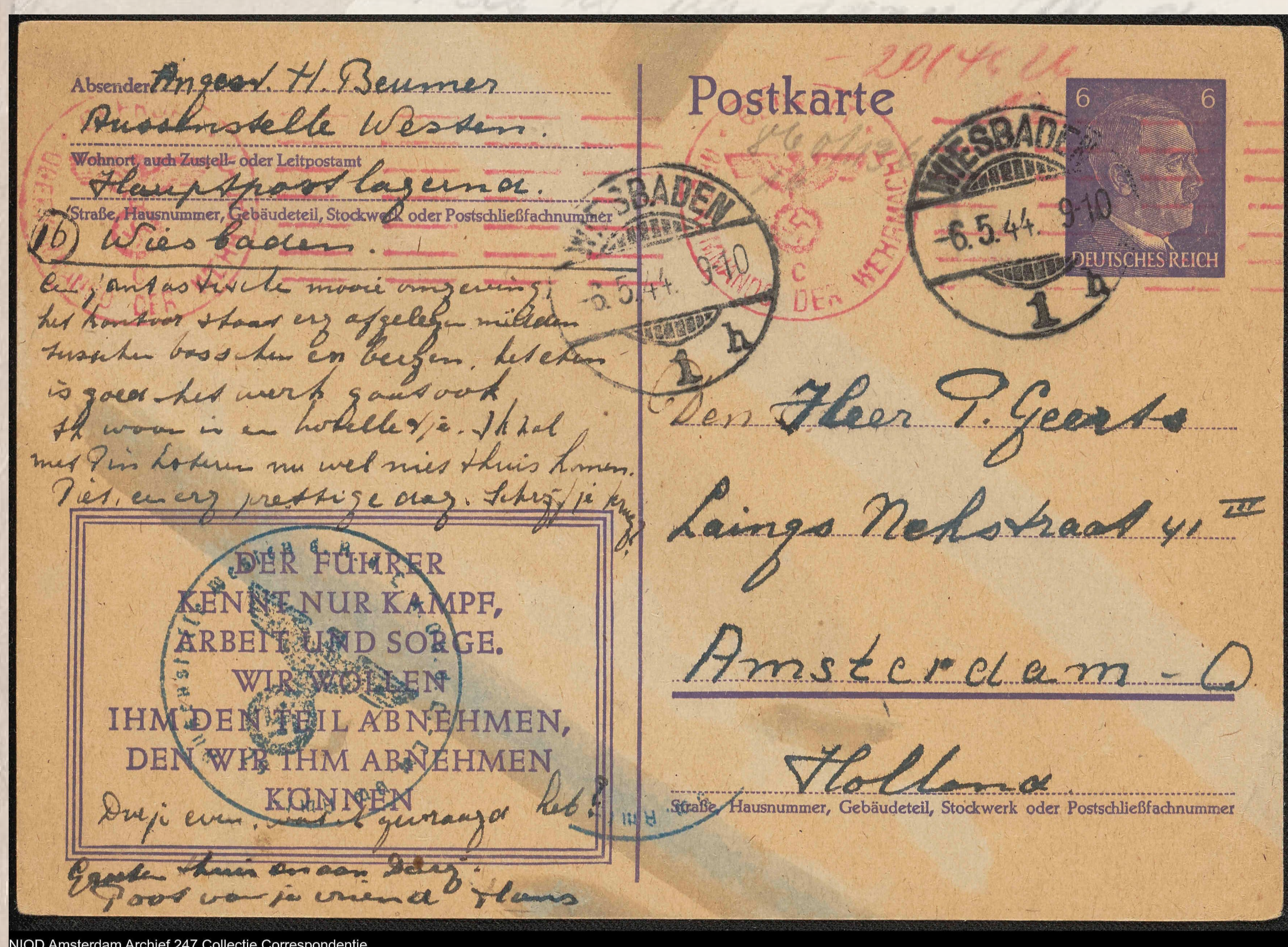
Postcard with stamps, NIOD collection 247

"This project preserves, scans, transcribes, and annotates a collection of personal correspondences related to the German Occupation of the Netherlands in World War II and the War of Independence in Indonesia to create a structured, enriched, and machine-readable dataset for the Digital Humanities."