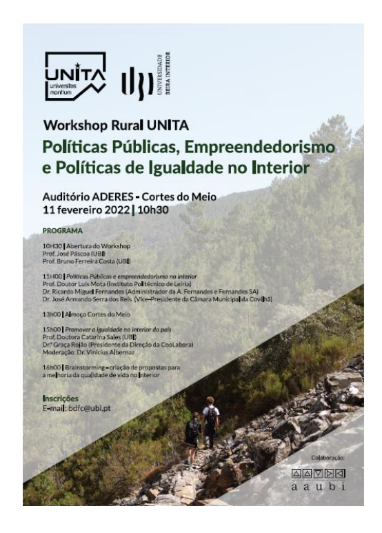
Poster of the first workshop at UBI

Below there are images of the brochures and posters for the dissemination of some of the workshops as well as photographs or screenshots taken during them.