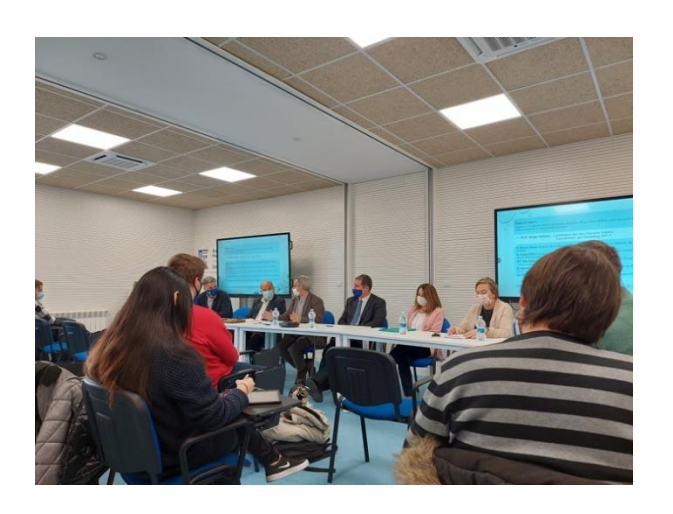
First workshop at UNIZAR