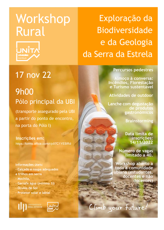
Poster of the second workshop UBI