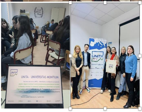
Second workshop at UVT