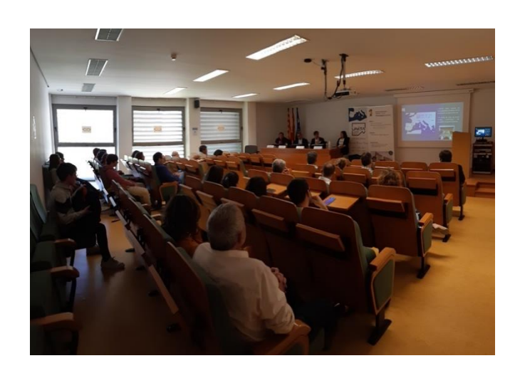
Second workshop at UNIZAR