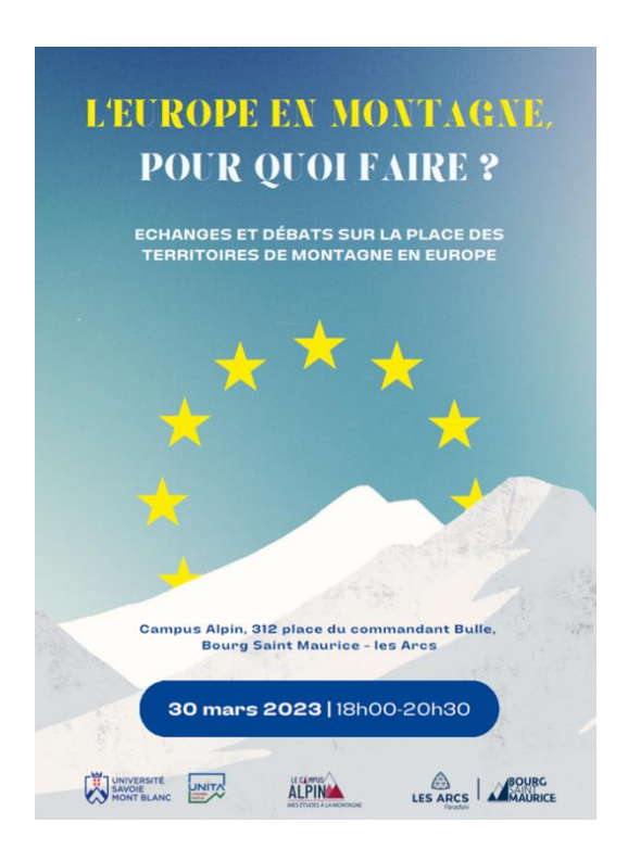
Poster of the second workshop at USMB