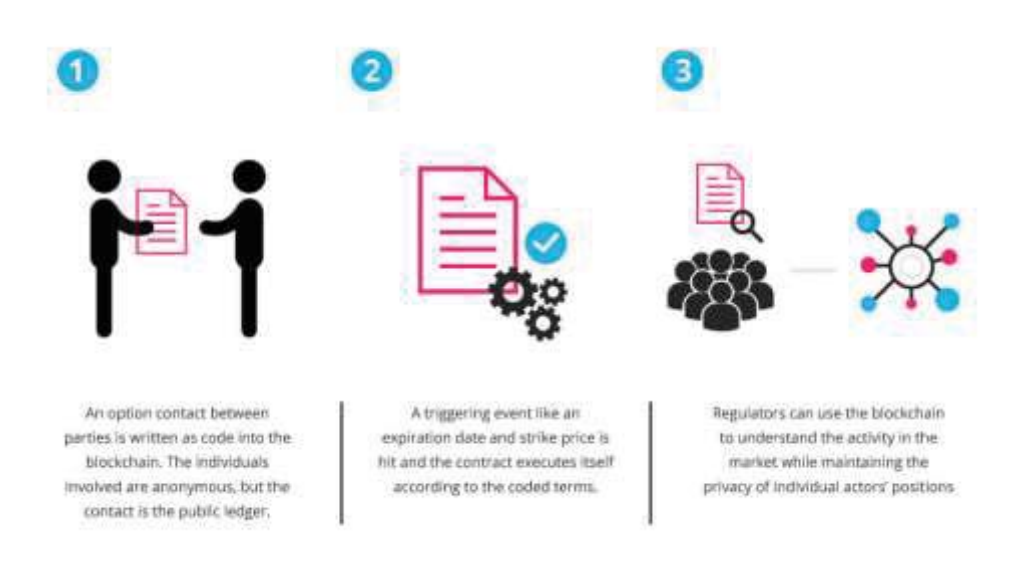
Figure 1. Core features and operation procedure of a Smart Contract in Blockchain applications

A smart contract is a digital protocol whose purpose is to verify or facilitate the negotiation or execution of an agreement. Smart contracts allow trusted transactions to be performed without the need for a third party. Transactions are irreversible and simultaneously tracked. It contains rules that participants have agreed to adhere to in their interactions with each other. When the predefined conditions of a smart contract are met, the contract is automatically activated. Its behavior is based on the algorithms on which it is built. Blockchain platforms that support smart contracts are also referred to as programmable blockchains.(Oliva et al., 2020). The operation mode of smart contracts in the context of a Blockchain is briefly presented in Figure 1.