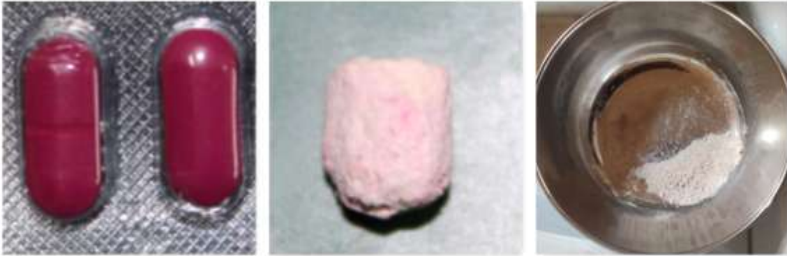
Figure 2:- STUDY SIDE (with Crushed TRANSET MF Tablet inside the extracted socket).