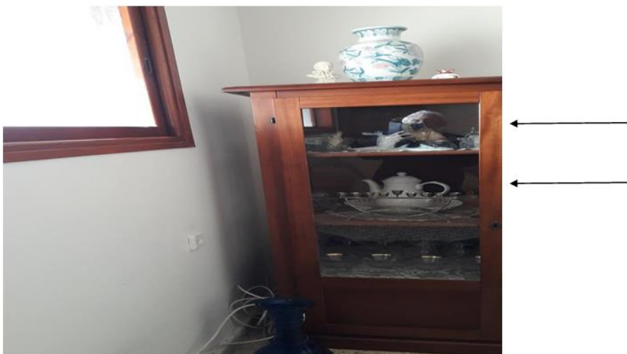
Figure 1. A Photo which might imply, that Light Beams, from separate sources, can consolidate

Thus, Figure 1 demonstrates that many light beams like “wave 2” might meet many light beams like “wave 4”, and then, some of these light beams might also continue to travel on the same direction and in the same line and thus, consolidate.