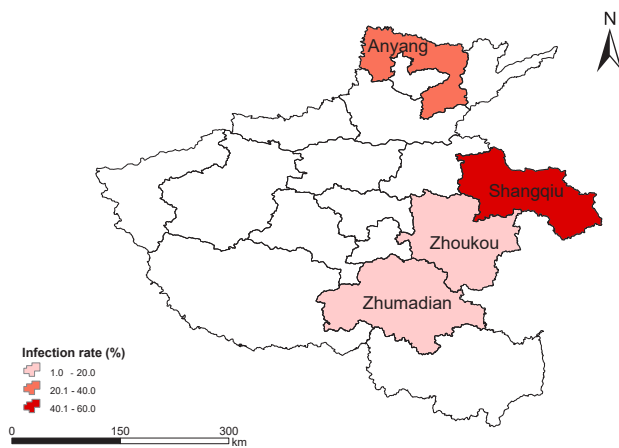
Fig. 1. Geographical distribution of infection with Blastocystis sp. in domestic rabbits in Henan, Central China. Infection rate expressed as prevalence.

These findings indicate the possibility of transmission of Blastocystis sp. between humans and animals.