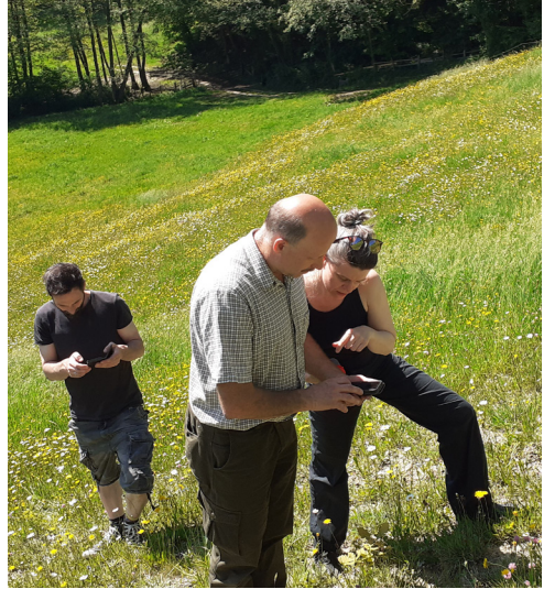
The facilitator deals with the administration and offering environmental advice and support.

a key building block of the Farmer Cluster family, enabling data to be gathered on farmland wildlife at a much wider scale than the Farmer Cluster could achieve on its own.