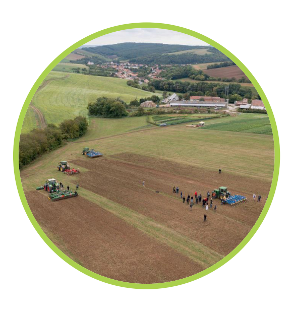
Sharing knowledge through Farmer Clusters can deliver greater benefits for farmers and biodiversity.