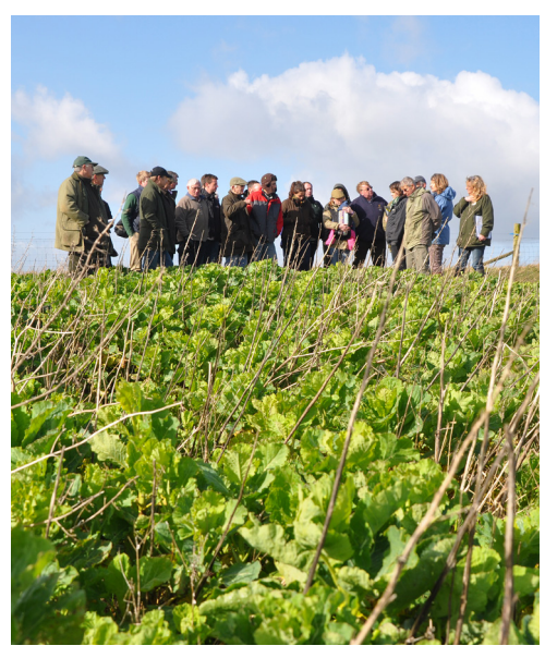
Farmer Clusters involve a community of local farmers who share knowledge and support each other to improve biodiversity and the ecological health of their farms.