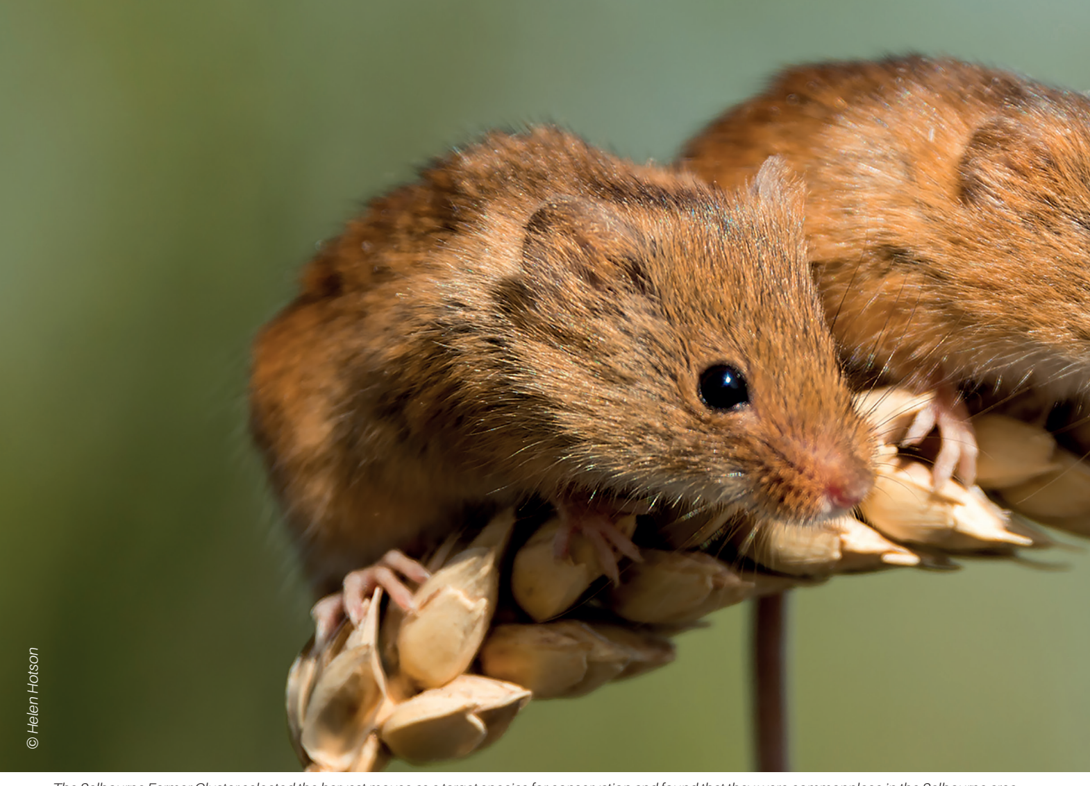
The Selbourne Farmer Cluster selected the harvest mouse as a target species for conservation and found that they were commonplace in the Selbourne area.