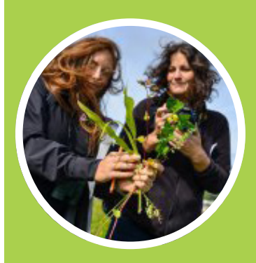
STEP 1 A lead farmer decides they would like to set up and lead a Farmer Cluster in their area.

both comprise five key steps and are outlined in the diagrams below.