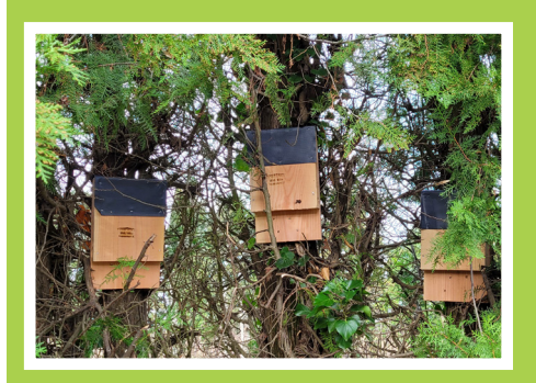
STEP 3 Group uses knowledge of the local area to decide on their aims.