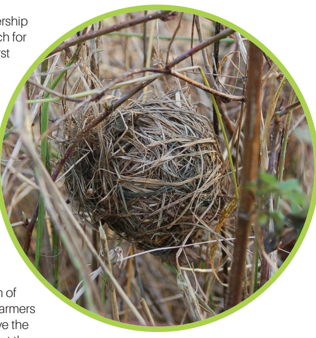
A harvest mouse nest.

volunteers from the partnership gathered together to search for the species and on their first search 54 harvest mouse nests were found on two farms, with every volunteer locating a nest. Later surveys across 28 separate one km<sup>2</sup> sampling sites found 472 nests, showing that, far from being extinct in the area, harvest mice seem to still be relatively commonplace in the Selborne area. Analysis of the data collected on each of these nests will allow the farmers to work together to improve the habitat further, ensuring that these small mammals continue to thrive.