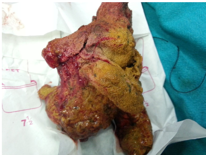
Figure 2: Evacuated surgical sponge.

On incising the mass, a big retained surgical sponge was found.[Figure 2] Postoperative period was uneventful. Oral feeds started on fifth postoperative day and patient was discharged on the 7th day. [Figure 3]