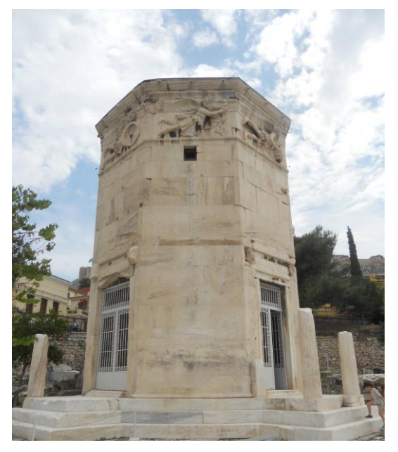
Figure 1. Northern view of the Horologion of Andronikos Kyrrhestes

The Horologion of Andronikos Kyrrhestes (Fig. 1) was built in 100 B.C. by the great Greek astronomer, engineer and architect Andronikos Kyrrhestes who was also its sponsor (Noble & Price, 1968; Wycherley, 1978; Kienast, 2013). It is mostly known as "The Tower of Winds" or "Aerides" (which means "Winds" in Greek). The building made of Pentelic marble is an architectural masterpiece of the late Hellenistic period. The main building has octagonal structure and a cylindrical annex is attached to its south side. In the northeast and northwest side of the main building there are two large openings serving as entrances. The entrances denote the north orientation and the annex the south. Thus, the monument is constructed in the north-south orientation enhancing its astronomical importance and use.