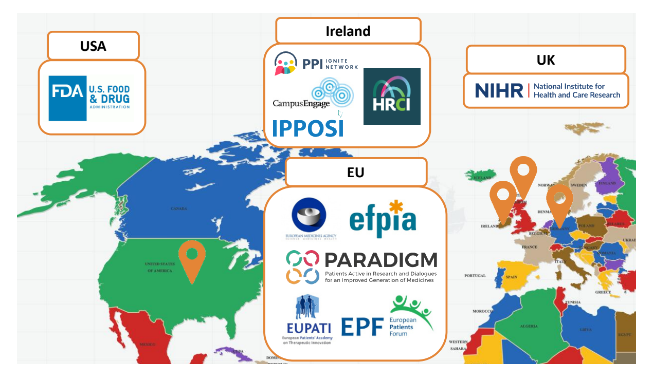
Figure 1: Examples of major players engaged in PPI-related activities within the networks of the Avicenna Alliance members.

There is currently no coordinated international PPI initiative specific to the field of digital health, as inferred from our review of the international PPI landscape at the time of writing. Relative to other health innovation communities (e.g., clinical trials), the in silico medicine community is therefore weakly positioned to effectively valorise on the increasingly evolving PPI opportunity for enhancing the generation of positive societal impact. Therefore, the community also faces the imminent threat of becoming left behind, such as by missing out on access to PPI public funding mechanisms which are increasingly demanding dedicated PPI provisions to be an eligible applicant.