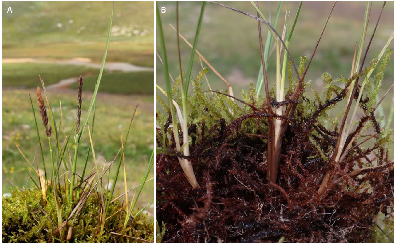
Fig. 3. – Calamagrostis lonana Eggenb. & Leibundg. A. Habit of the aerial parts with moss cushion of Warnstorfia exannulata (Schimp.) Loeske. B. Upper root space in the moss layer.

widespread calcareous sediments in the area. The examined soil profiles of Calamagrostis lonana growth sites always show a similar structure: a 10–15 cm thick moss layer (Fig. 3) is directly followed by a layer of grey alluvial loam more than 50 cm deep, intermixed with dead mosses probably from earlier inundations. The pH value remains unchanged over the entire profile depth (pH 6.5). Roots of C. lonana were found both in the moss layer (Fig. 3) and in the alluvial loam and can be detected down to a depth of about 40 cm. The root mass of Calamagrostis in a more closely examined soil sample was between 0.11 g (top layer) and 0.02 g or 0.04 g (lower layers) per 100 g of soil material. Whether during inspections at the beginning of August, in September or at the beginning of October the soil was always found to be completely water saturated.