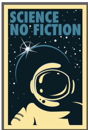
Figure 2 Logo to promote the 2023 Townhall meeting