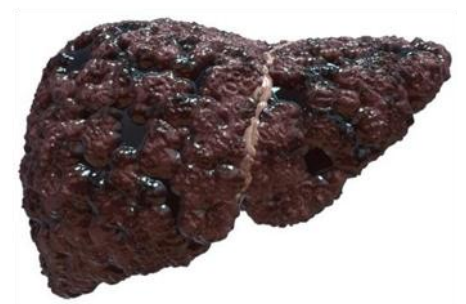
Figure 3: Chronic Liver Disease

Chronic cholestasis or long-term exposure to alcohol, drugs or chemicals can result in liver failure progressing into liver fibrosis. Liver fibrosis is characterized by deposition of scar tissue and its end-stage is called liver cirrhosis. Other causes of chronic liver failure are viral hepatitis, metabolic diseases like Wilson disease (copper storage disease) or auto-immune diseases (e.g. primary biliary cirrhosis, primary sclerosing cholangitis). During chronic liver injury, the endothelial cells, hepatocytes and cholangiocytes can be damaged due to the accumulation of toxic metabolites, reactive oxygen species and bile acids. This results in the activation of Kupffer cells and the recruitment of inflammatory cells and the subsequent release of growth factors (e.g. Transforming Growth Factor- \beta (TGF- \beta ), cytokines, reactive oxygen species that induce the activation and proliferation of hepatic stellate cells. These cells are major players in the development of liver fibrosis. A major consequence is a remodelling of the ECM that leads to deposition of scar tissue (fibrosis) and liver dysfunction. Therefore, the activation and proliferation of stellate cells are considered key events in liver fibrosis.